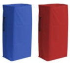
120 L plastified bag