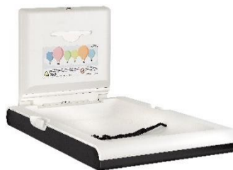
CP0016VCSB Polypropylene /Stainless steel Matte black finish