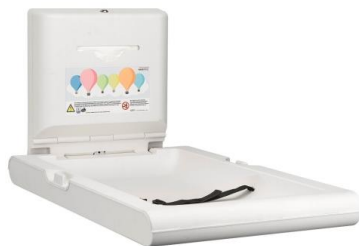
CP0016V Polypropylene White finish