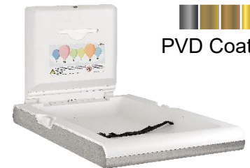
CP0016VCS Polypropylene /Stainless steel Satin finish