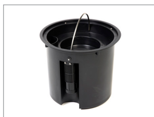
INTERNAL DETERGENT TANK