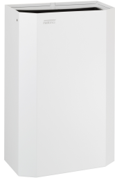
PPA2212 White Finish