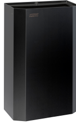
PPA2212B Black Finish