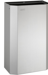
PPA2212CS Satin Finish